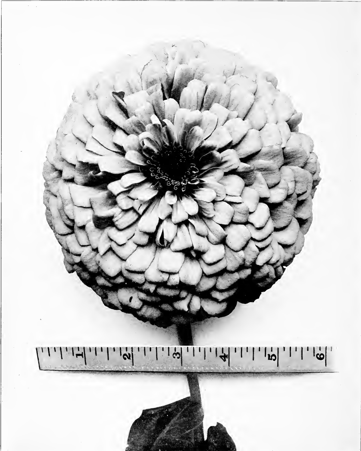
BODGER'S DOUBLE GIANT ZINNIAS